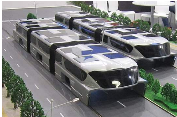
Figure 1: The TEB in Qinhuangdao, China