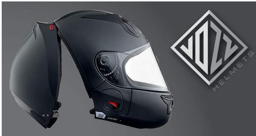
Figure 3: The Vozz Helmet